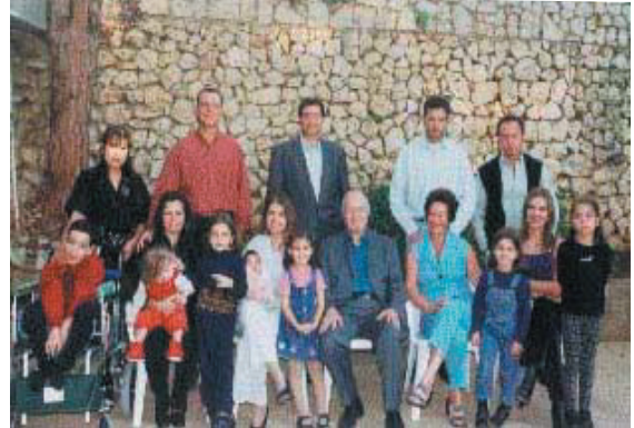
A happy grand father with my seven grand children

I did not attend her wedding but she was so happy to attend mine. The Lord led me to establish “ Spirit Channel ” a satellite TV station over the Middle east, North Africa and Europe. He is opening new doors for me on a wider and international scale.